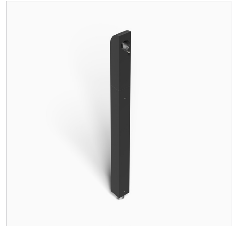
12" Single Flood Extension: EXF-S-12-BK