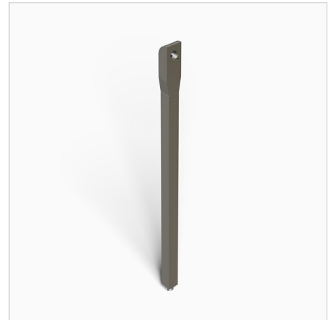
24" Double Flood Extension: EXF-D-24-BZ